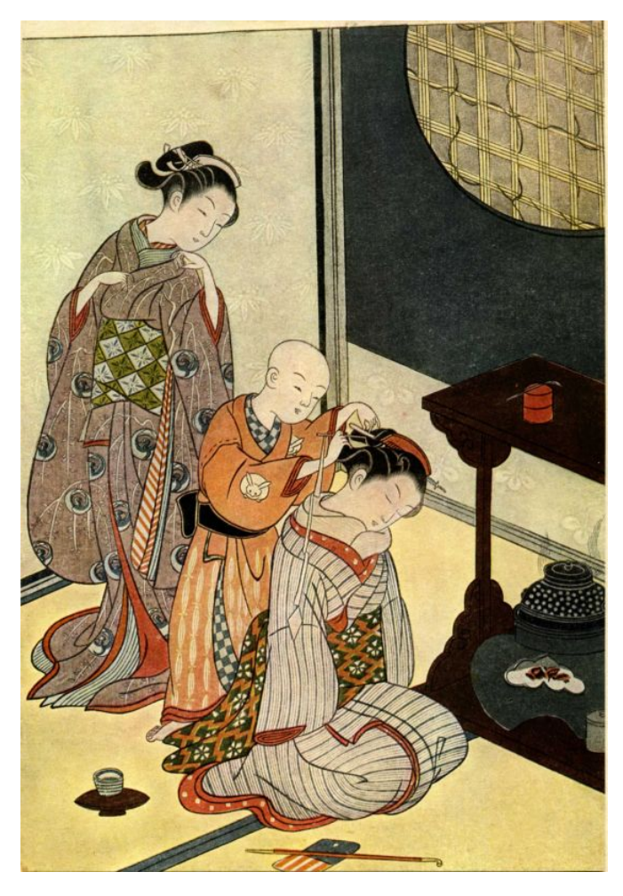
HARUNOBU. The Sleeping Elder Sister.