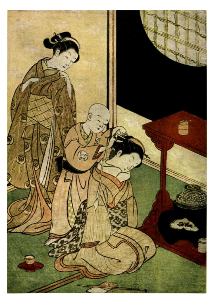
HARUNOBU. The Sleeping Elder Sister.