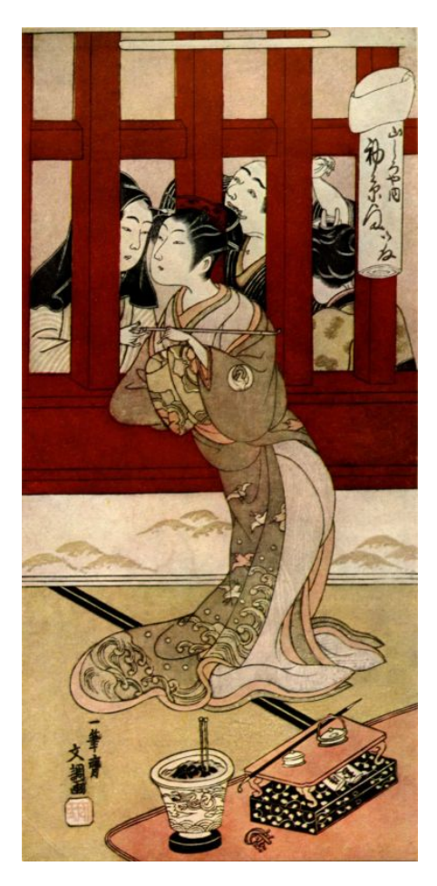
BUNCHO. Actor as Woman talking to Men.