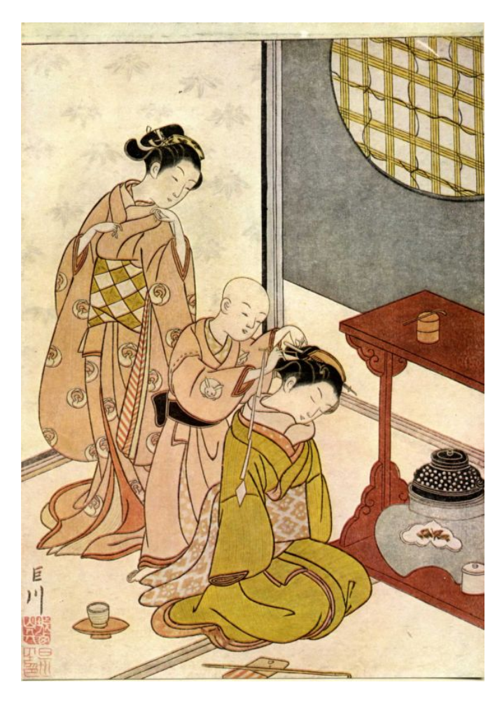
HARUNOBU. The Sleeping Elder Sister.