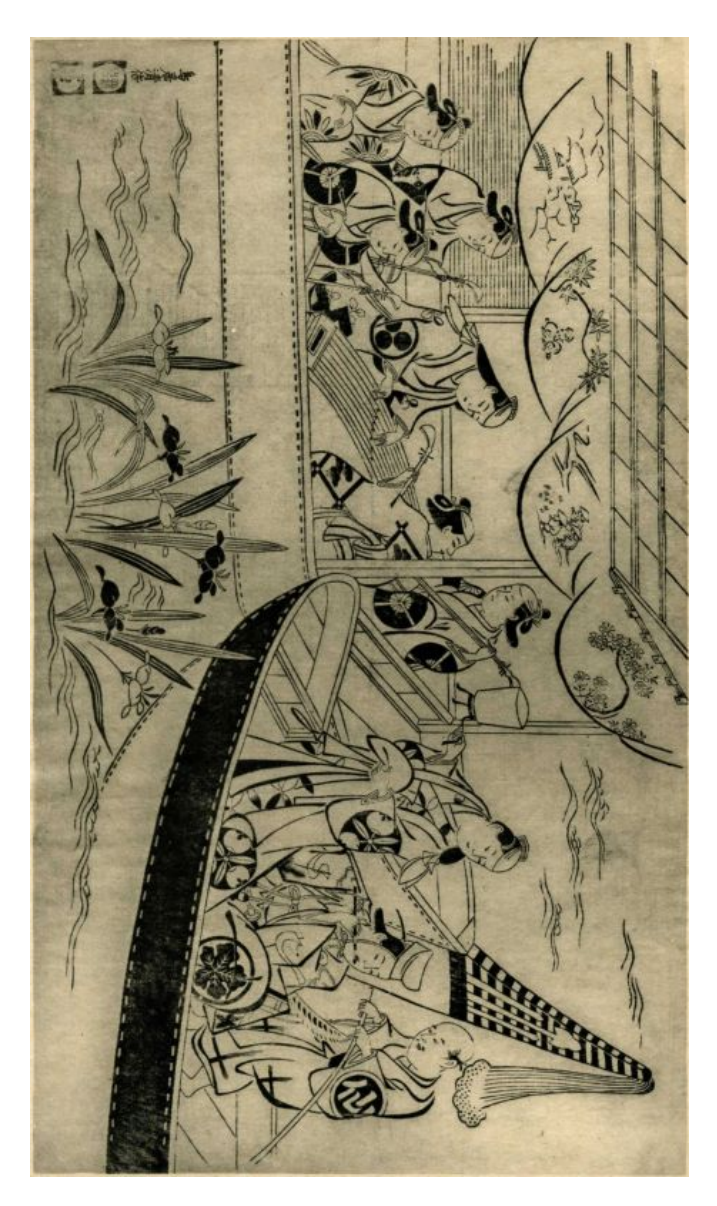
KIYOMASU. Actors' Boating Party