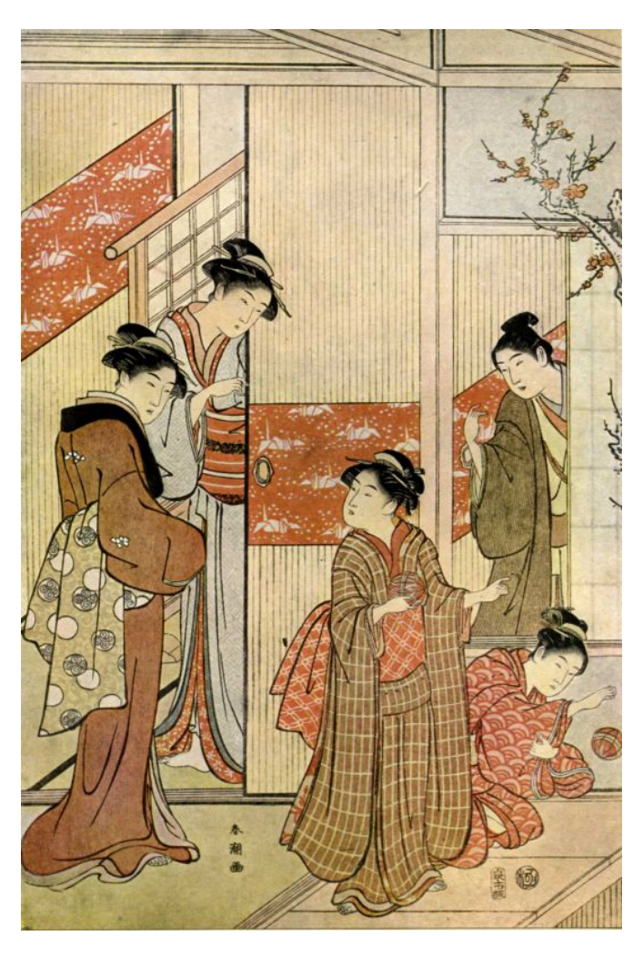
SHUNCHO. Women watching Girls bouncing Balls.