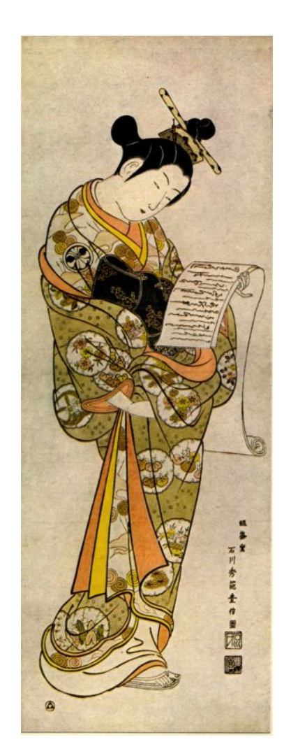
TOYONOBU. Actor reading Letter