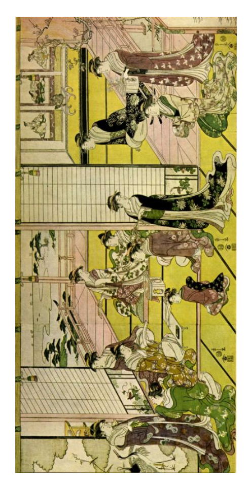
EISHI. Fête in a nobleman's palace.