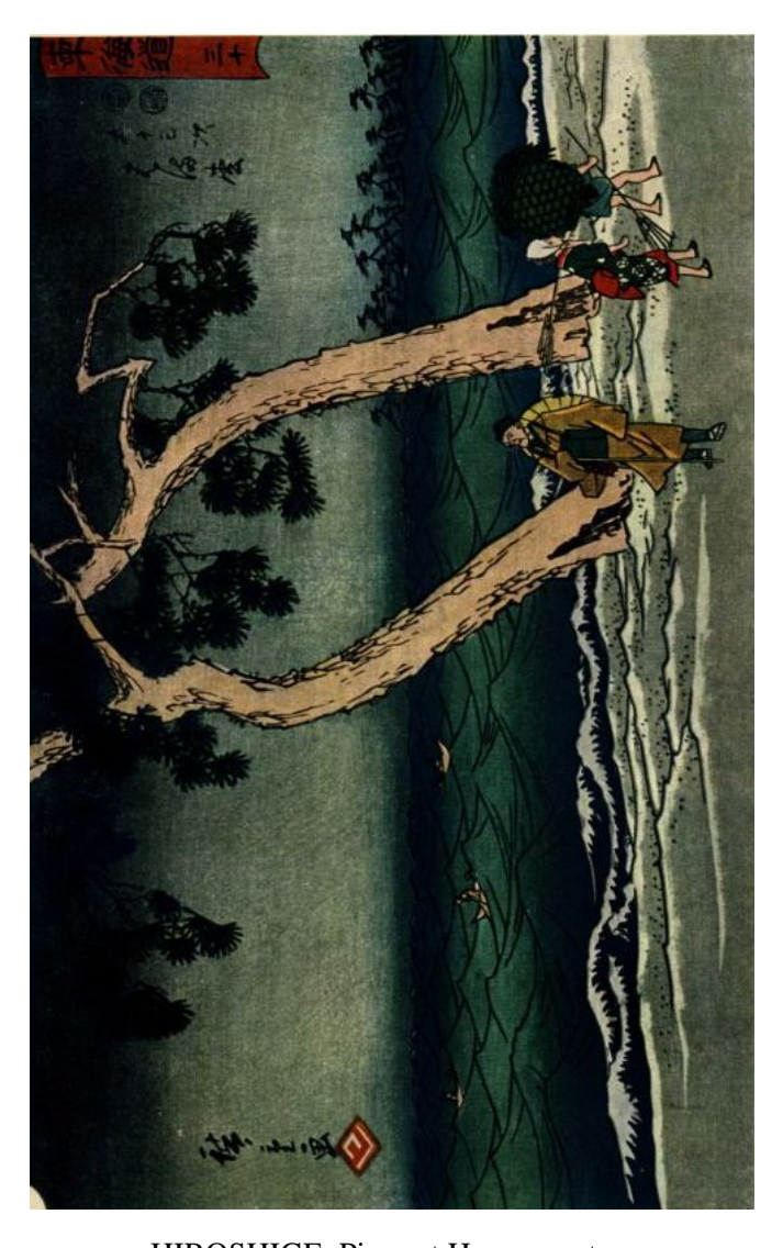
HIROSHIGE. Pines at Hammamatsu.