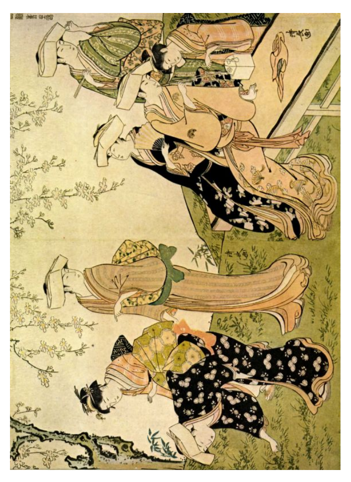
KIYONAGA. Holiday Group at Gotenyama.