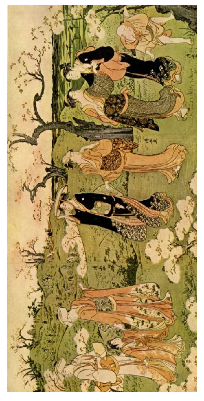
KIYONAGA. Picnic Party.