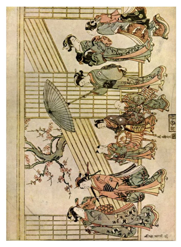
KIYOMITSU. Daimyo Procession Game.