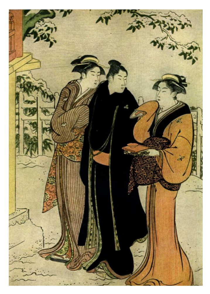
KIYONAGA. Man and two Women approaching Temple.