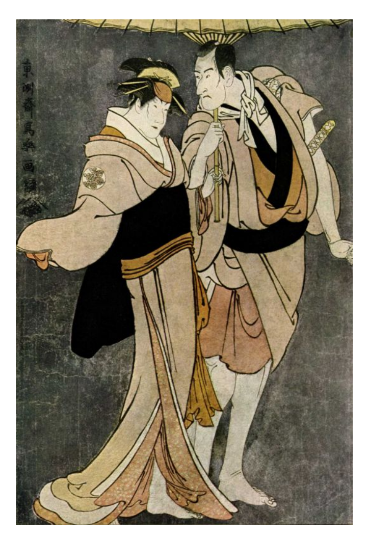
SHARAKU. Two Actors.