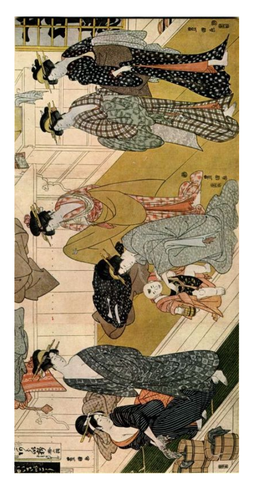
TOYOKUNI. Women in Bath House.