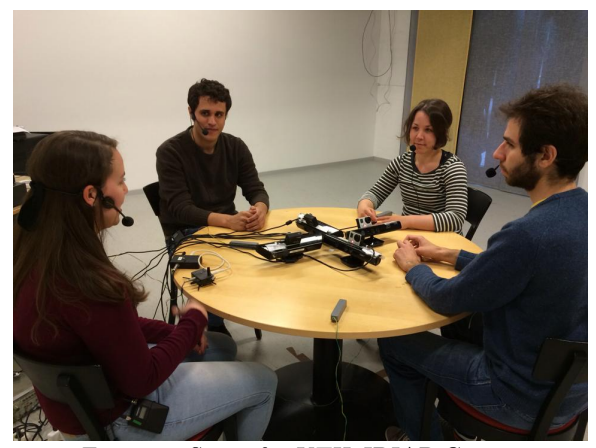
Figure 1: Setup for KTH–IDIAP Corpus.

For the following paper we used two corpora. The first corpus was the "KTH–IDIAP Corpus" [9] and the second one is the "Conversational Synthesis Corpus". The KTH– IDIAP corpus is a corpus of group interactions. A Post-Doc had to identify the best suited candidate for a imaginary prestigious scholarship out of groups of three applicants. In